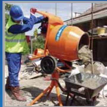
Barrow Height Tipping