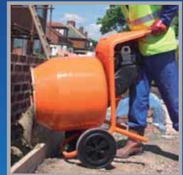
Balanced Design Ensures Control When Tipping