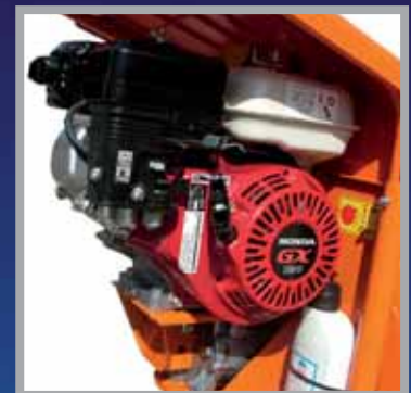
Honda Petrol With Oil Alert