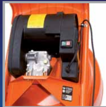
230v & 110v Electric