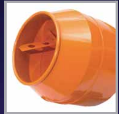
Rapid Mix Paddles