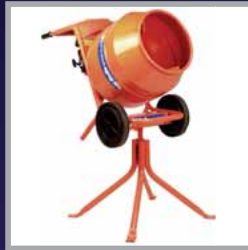
Heavy Duty Tip-up Stand